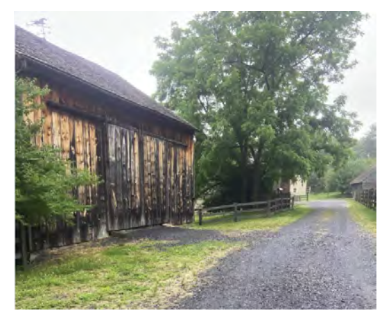
Burnside Plantation - 1748

• At the end of the path, cross Schoenersville Rd, (also known as Mauch Chunck Rd. or Paint Mill Rd.) to the Burnside Plantation.