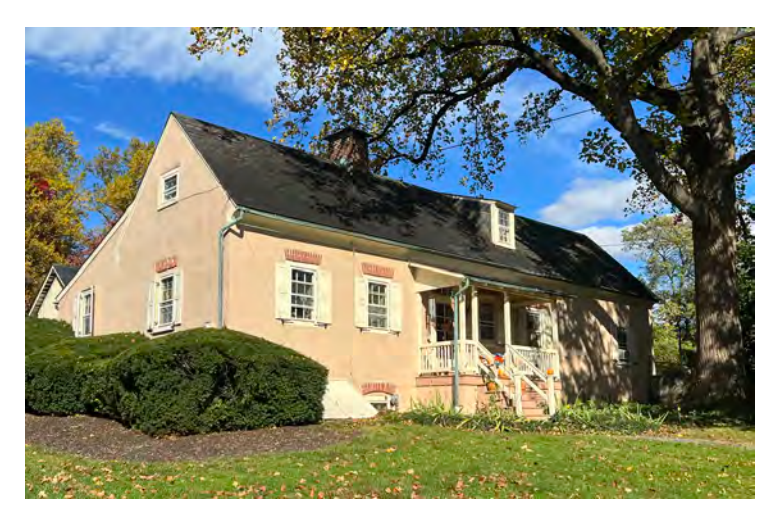
Das Schnitzhaus - 1746

On the right is the oldest existing building of Moravian Academy. (Formerly the Bethlehem Steel Band building and and later Bethlehem Public Library.)