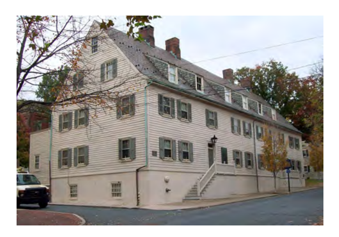
Das Gemeinhaus - 1741

• At Heckewelder Place head in a northerly direction (14 degrees).