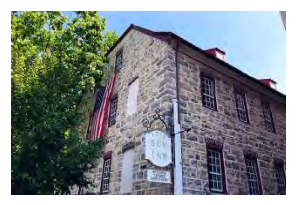
The Sun Inn - 1758