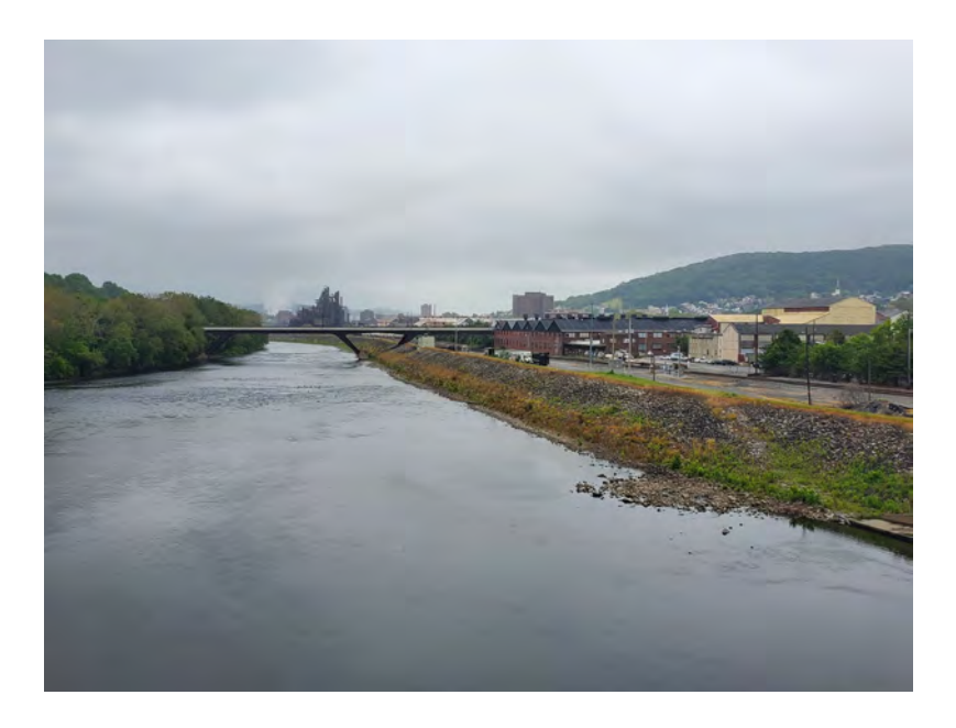
View from Hill to Hill Bridge looking east, 2023