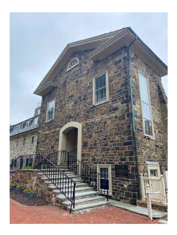
The Old Chapel