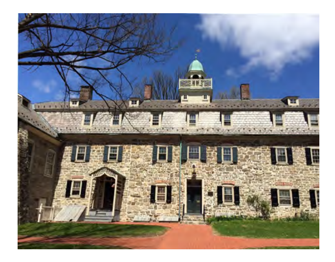
Bell House - 1746

On the right, past the Single Sisters House, is the Bell House and the Gemein House; on the left opposite the Bell House is the Widows House.