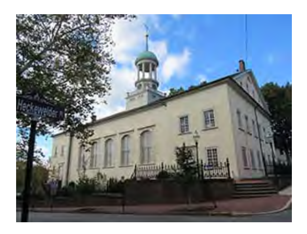
Central Moravian Church - 1803

who was burned at the stake. ______ was a term for the Moravians' communal way of life. The congregation was divided into groups called choirs according to sex and marital status.