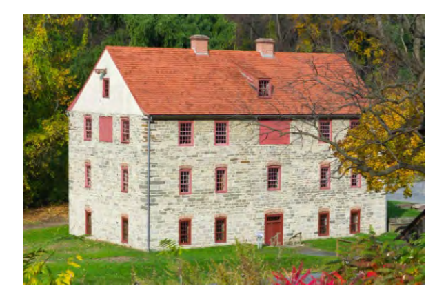
The Tannery - 1761

• Cross the bridge over the Monocacy Creek and follow the path south along the creek to Main and Spring Streets.