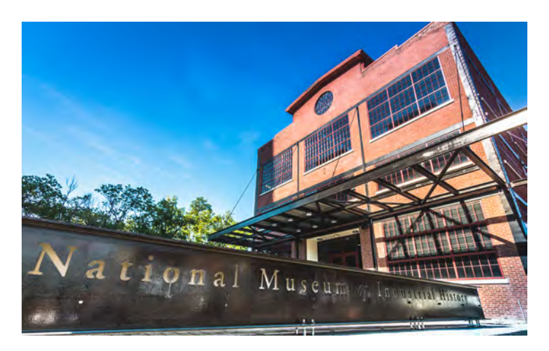
National Museum of Industrial History - 2016

• At Polk Street head north and then east on E 2nd Street. On the left you will come upon this building: ______.