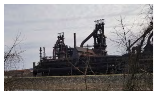
Bethlehem Steel Blast Furnaces

• Make a right onto Sands Blvd and follow that up the hill to Daly Avenue. At the light, cross Daly Avenue using the crosswalk to the South Bethlehem Greenway.