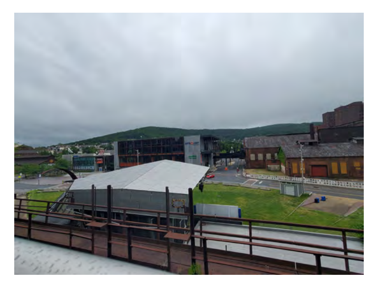
A view of ArtsQuest from the Hoover-Mason Trestle, 2023